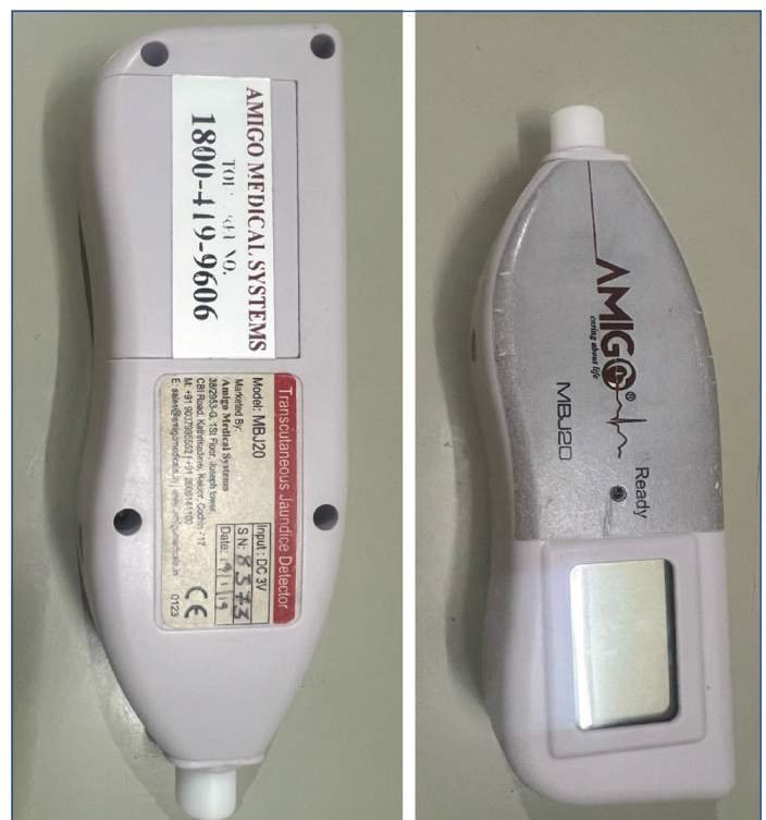
[Table/Fig-2]: Transcutaneous bilirubinometer.

Transcutaneous bilirubin: The Bili check Transcutaneous Bilirubinometer was used to measure transcutaneous bilirubin, and the readings were obtained from unexposed sites such as the glabellar region of the forehead (just above the internasal area, covered by an eye mask), the chest at the level of the manubrium sterni, and a point over the anterior superior iliac spine by keeping the transcutaneous bilirubinometer vertical in contact with the neonate's skin [17]. The average of these three readings was determined and considered as the transcutaneous bilirubin for the particular day [Table/Fig-2].